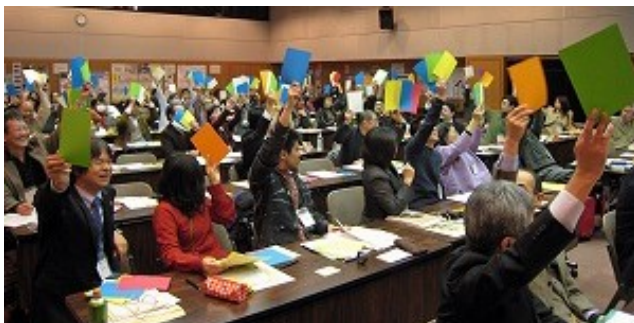
multistakeholders got together and discussed the DESD promotion at ESD-J nationwide meeting 2009